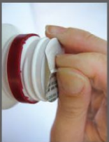
Hidden Pulling Tab