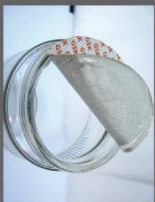
Glass Bottle Seals