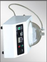
Leak Detection System